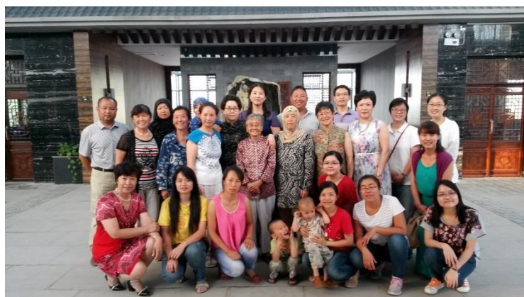
Seminar at Wuzhong Mosque for Girl Students, Ningxia, August 2015.

Apart from visits and seminars, the China Office produced a publication Pathing Peace, Celebrating Life – commemorating the 10 th Anniversary of the PeaceWomen Across the Globe which came out in early 2017. It reviews the work of the PWAG China Office in the last decade, and promotes the new WikiPeaceWomen project.