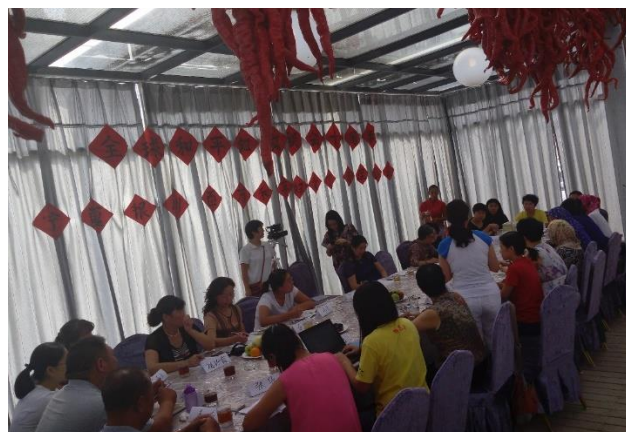
Seminar on PWAG, at Yinchuan, Ningxia, August 2015

In 2015, to commemorate the 10th anniversary of PWAG, the China office convened Workshops and Seminars in Beijing, Ningxia, and Inner Mongolia, and paid visits to over 10 PeaceWomen in Northwest region of China. We reviewed the project’s achievements, and discussed ways to further the project. The new project of writing stories of Million PeaceWomen was welcomed by the Chinese women’s groups.