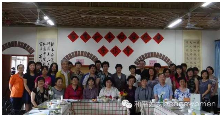
“Seminar on Million PeaceWomen Project”, at Little Donkey Farm, Beijing, June 2015.

About one hundred women from mainland China, Hong Kong and Taiwan met in Kunming in December 2005 to celebrate the 1000PeaceWomen project and to connect with each other. Since then, the project of PeaceWomen Across the Globe with its activities in China has entered its 12 th anniversary.