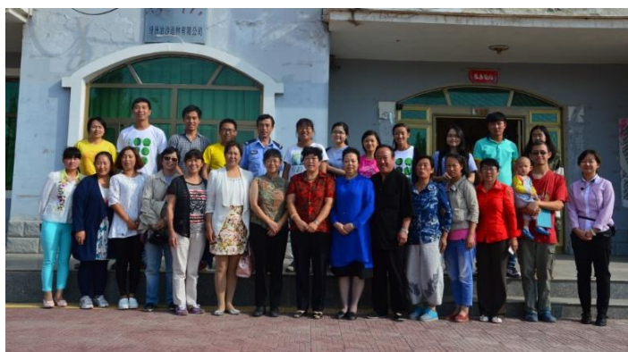
Seminar on PWAG, at Urdos, Inner Mongolia, August 2015