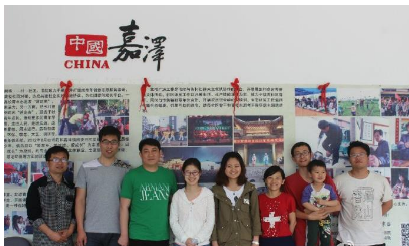
Promoting the Million PeaceWomen Project at Suzhou, Jiangsu Province. May 2016

PWAG China Office, working jointly with Renmin University of China, Southwest University, Fujian Agricultural and Forestry University, and Love Our Home Village Association, launched the project “Youths Loving Our Home Village”, and organized activities in university campuses and in social arenas to encourage the collection of peacewomen stories.